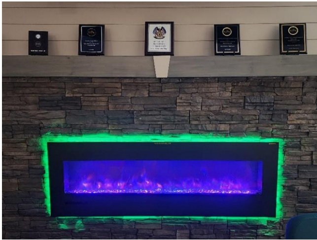
Plaques collected during ALR 60's March Booty Run

We have had a great winter season cooking for the Queen's Kitchen and Plaque capturing, thank you to all who have helped make it a great winter. At one point in the day, we had five wonderful plaques graciously displayed on our Post fireplace mantle. Thank you to the post for allowing us to display them.