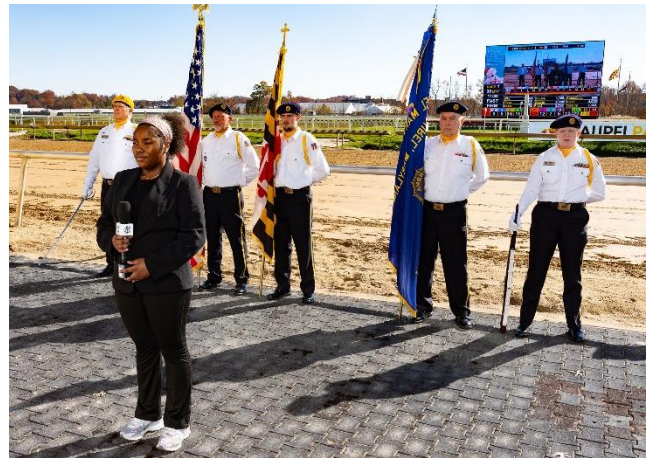
Laurel Park, 8 NOV 2025

On the 8th our Post 60 Color Guard was invited to Present the Colors before the beginning of the Veterans Day Celebration Races at Laurel Racetrack. As always, they represented Post 60 and all American Legion posts extremely well.