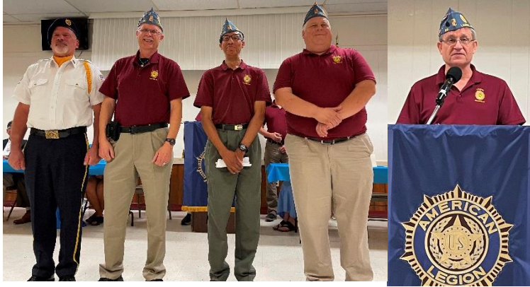
2024-2025 SAL Squadron 60 Officers