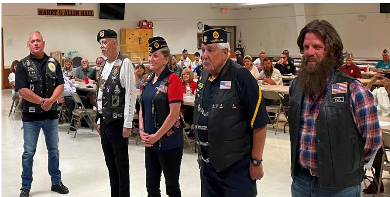
2024-2025 ALR Unit 60 Officers