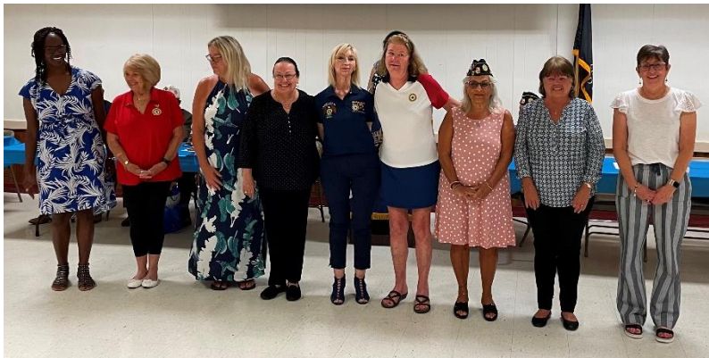
2024-2025 ALA Unit 60 Officers