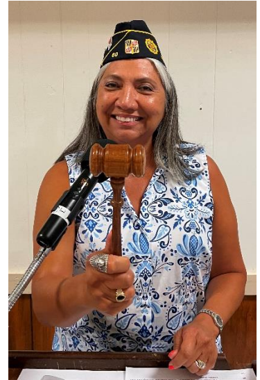
“I am in control here.”