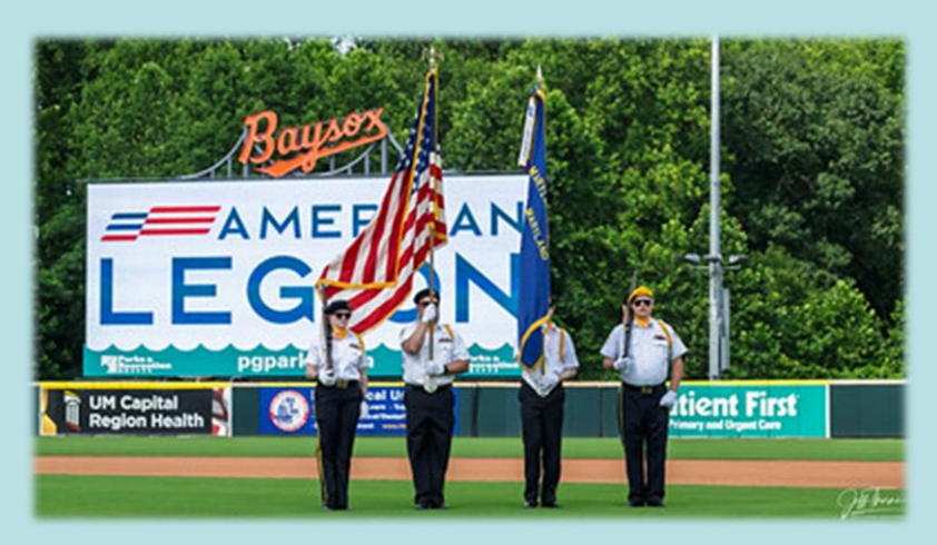
Post 60 Color Guard Presenting the Colors