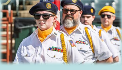
Waiting for the Command