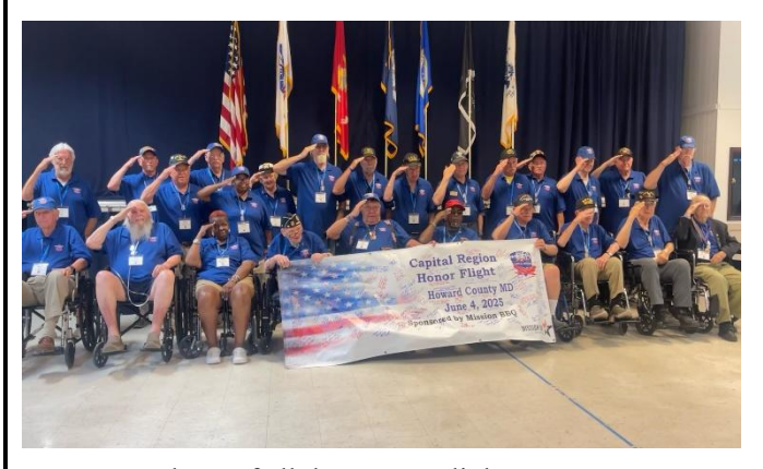
Group photo of all the Honor Flight Veterans

The month of June was exceptionally busy for us. On June 4th, Post 60 and Capital Region Honor Flight organized a welcome home ceremony for over 30 veterans. The event was highly rewarding, and we received an outstanding turnout from our community. It was a commendable way to welcome and honor our veterans.