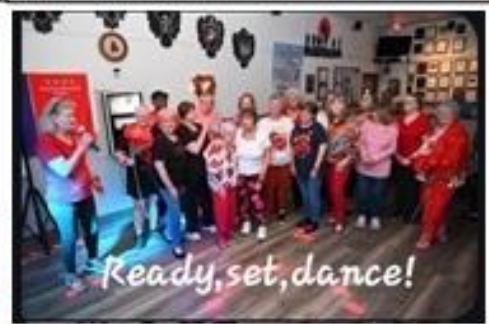
Dancing Queens in Action!

To all who helped—thank you for your time, energy, and commitment to honoring our Veterans and supporting those who serve. Together, We Make a Difference!