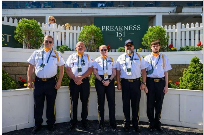
Color Guard at the 2026 Black-Eyed Susan Stakes

Your Post 60 Color Guard continues to stay extremely active representing our Post and community with pride. During May they led the Laurel Main Street Parade, presented the Colors before the Black-Eyed Susan Stakes at Laurel Park Racetrack, participated in the Massing of the Colors at Ft. Meade and The Joint Color Guards Memorial Day Ceremony at Ivy Hill Cemetery. They are also continuing preparations for the American Legion National Competition in Louisville, Kentucky this August. We appreciate all the support shown toward the Guard and their fundraising efforts as they proudly represent POST 60 on the NATIONAL STAGE.