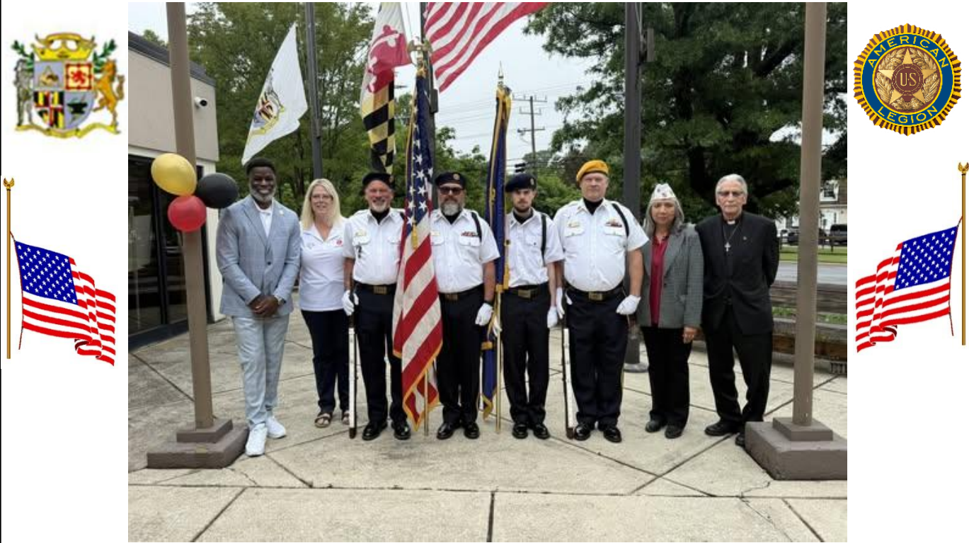
Post 60 and Laurel City Mayor Keith Sydnor at the Memorial Day Celebration