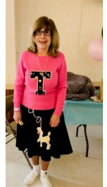
Dancing Dee in Poodle Skirt and 50's attire