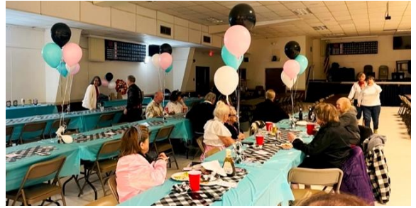
ALR 50's Sock Hop Dinner