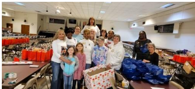
Post 60 Family members join with Gold Star Mothers in filling bags to send to Our Troops