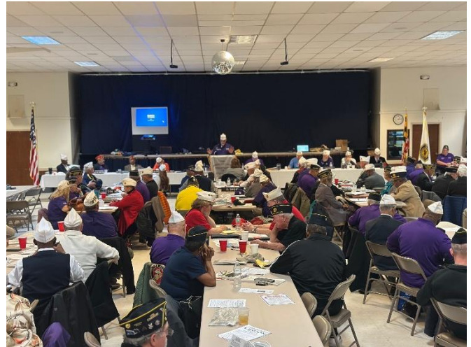
Part of the 200+ attendees at the DEC Meeting on February 16 th .

deck committee strolled in and put the hall back together for us. It was truly amazing how we came together to support our Department of Maryland Officers. It did not go unnoticed by our department officers how well our Legion family supports each other for the good of the Legion. This was definitely a proud moment for me.