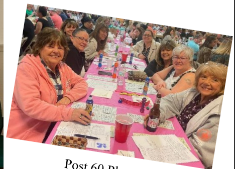
Post 60 Players