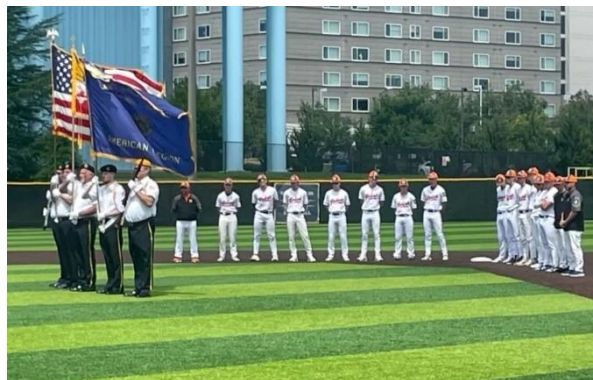
Post 60 Color Guard presents the colors at the Regionals

Please take a moment of your day for remembrance on September 11th of all the lives that were sadly taken 24 years ago. NEVER FORGET!