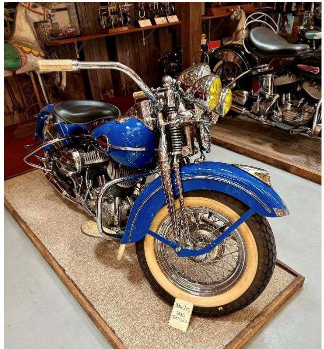
Ain't she pretty!